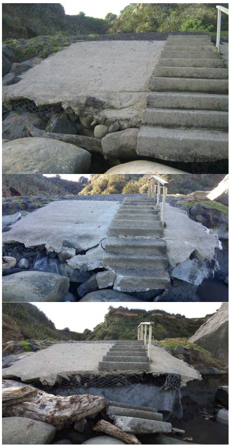
Photo 12 Access way to Waihi Beach, Hawera (above May 2014, middle May 2015, below May 2016)