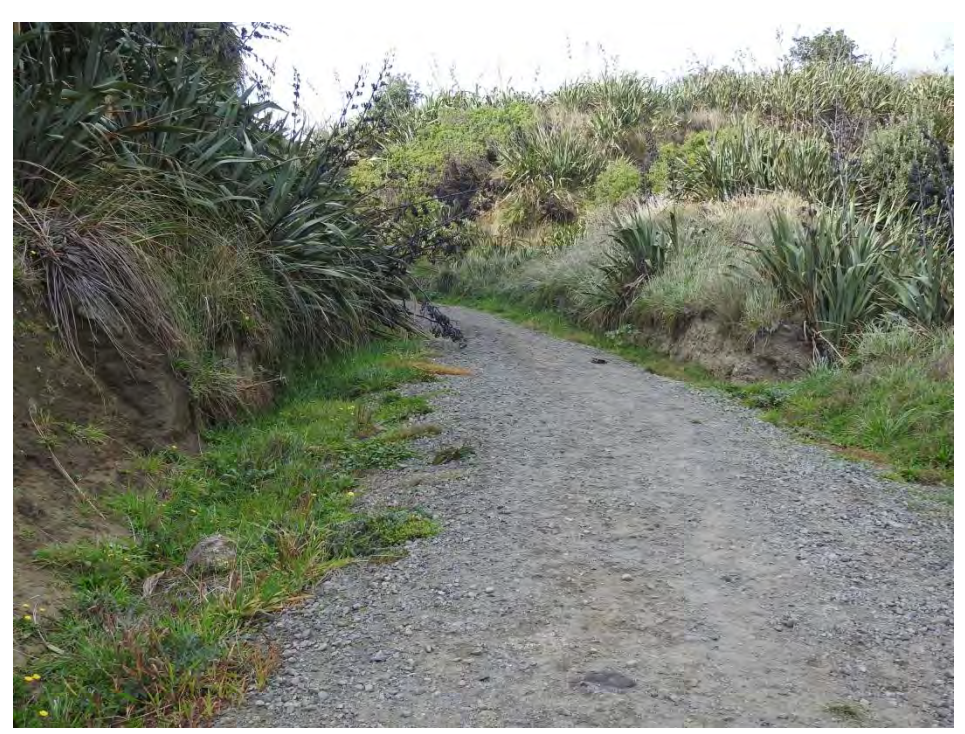
Photo 4 Beach track at the end of Denby Road leading to the gabion mattress consented under 6736.