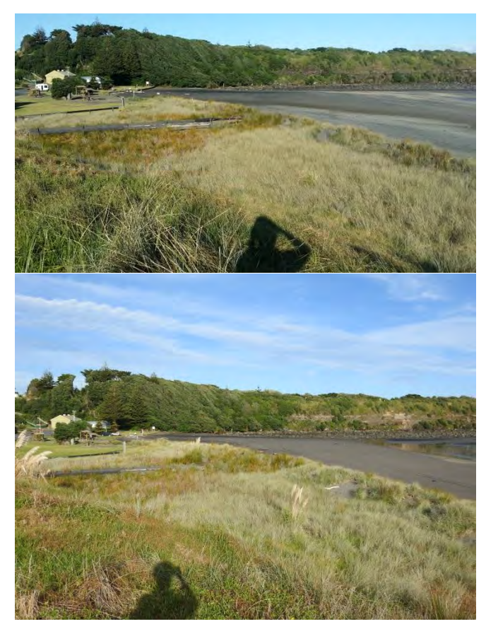
Photo 11 Dune planting at Opunake Beach (top May 2015, bottom May 2016)