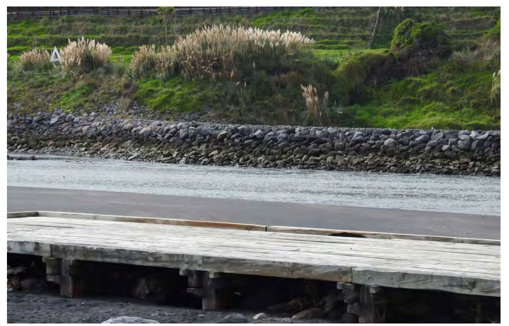
Photo 13 Training wall at Patea shown on the far side of the river (May 2016)

STDC have been undertaking significant repairs in this area, since works began in 2006. STDC continued repair works to the Patea groynes and training walls over the 2013-2014 period with an expenditure of approximately $40,000 associated with repairs to the eastern training wall in 2013.