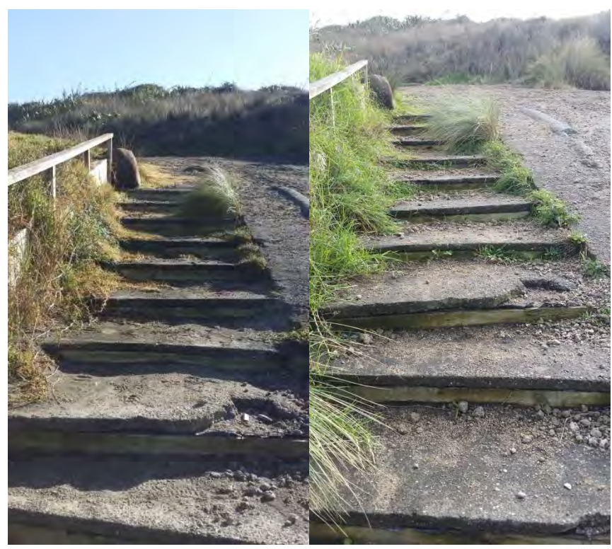
Photo 15 Access to Caves Beach, Waverley (right May 2015, left May 2016)