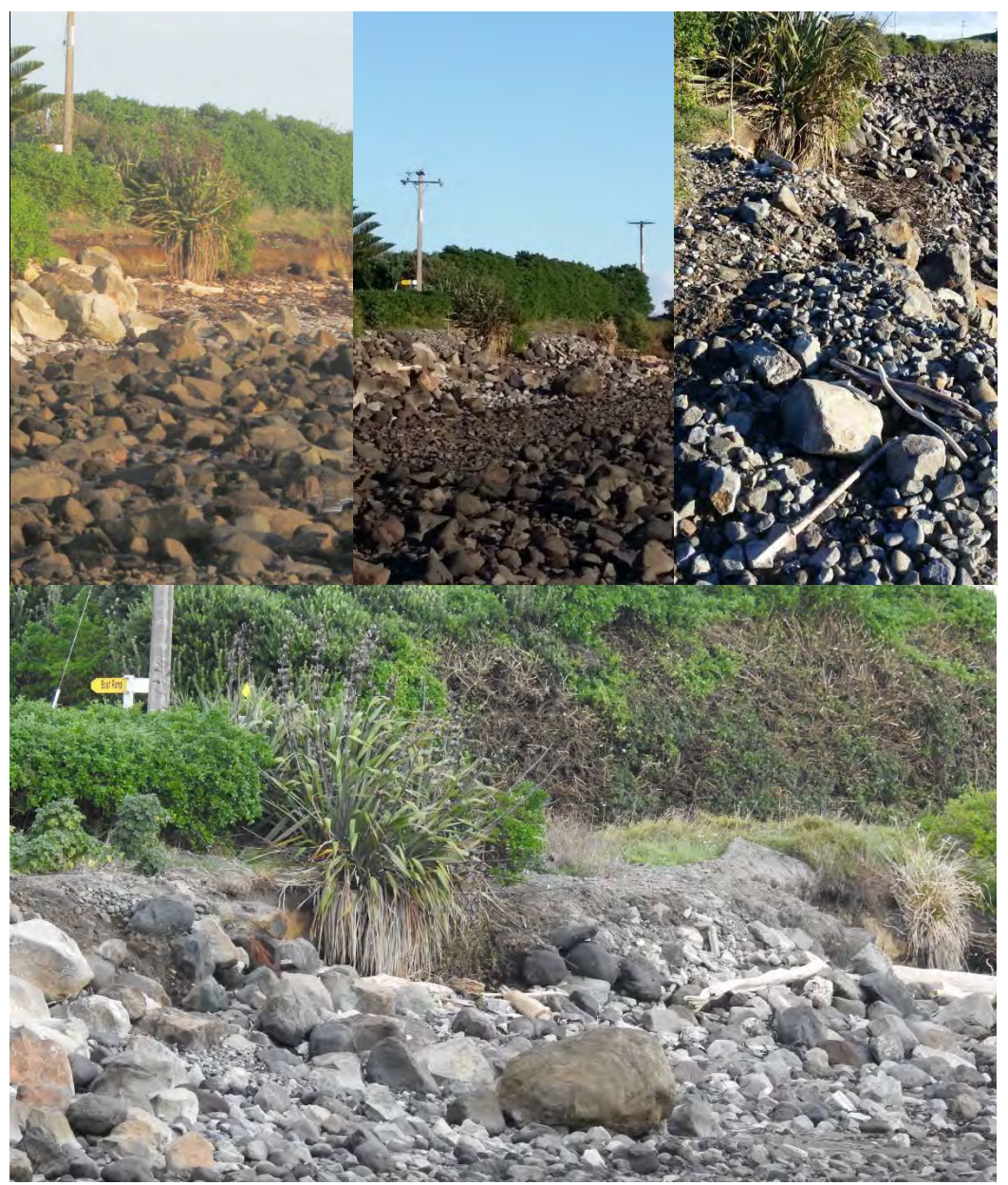
Photo 8 Bayly Road seawall (top left erosion on the south side of the seawall May 2014, top centre and right rubble used to prevent further erosion May 2015, bottom rubble remaining in place May 2016)

An inspection of the Bayly Road seawall was undertaken on 4 May 2016. The rip rap appeared satisfactory and areas of previous erosion at the south remained filled in with rubble (Photo 8).