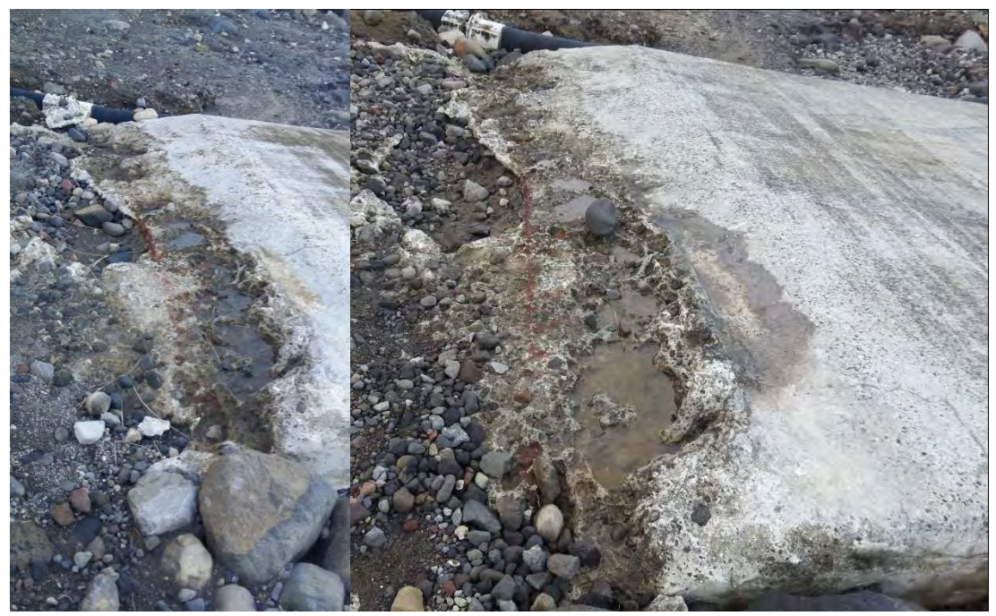
Photo 10 Top section of the Opunake Beach boat ramp (left May 2015, right May 2016)