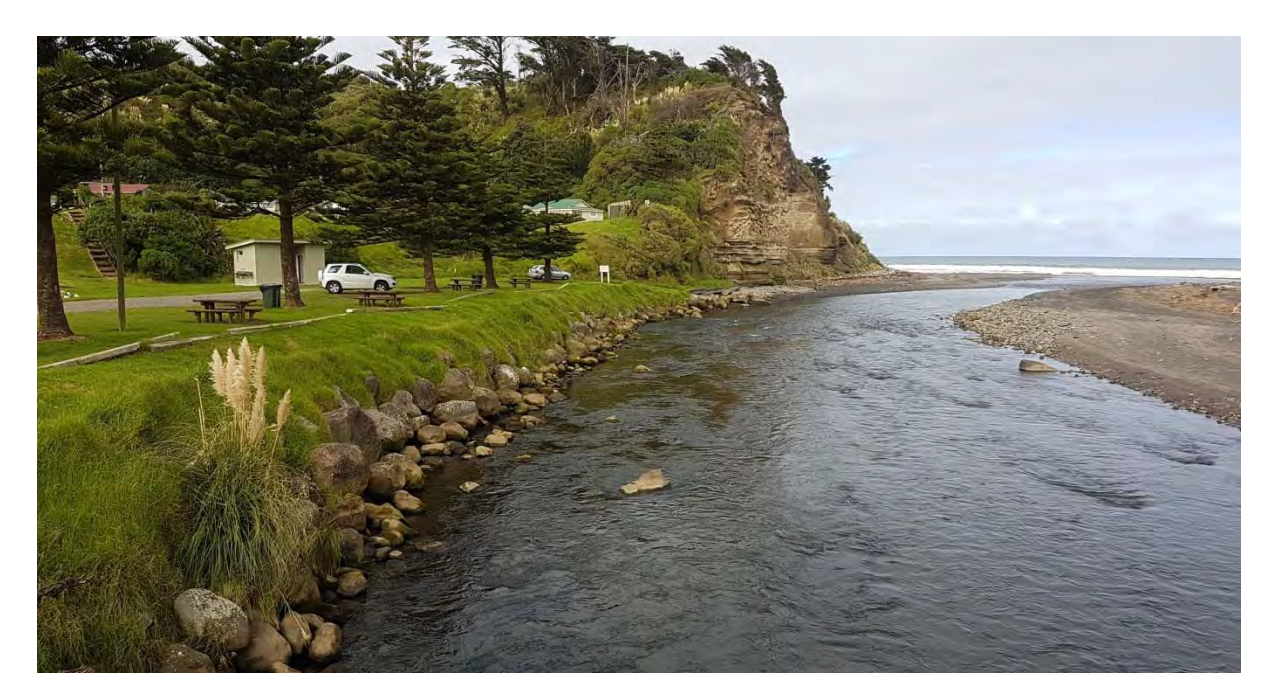
Photo 3 Looking downstream along rock protection works in the Kaupokonui Stream (April 2017)