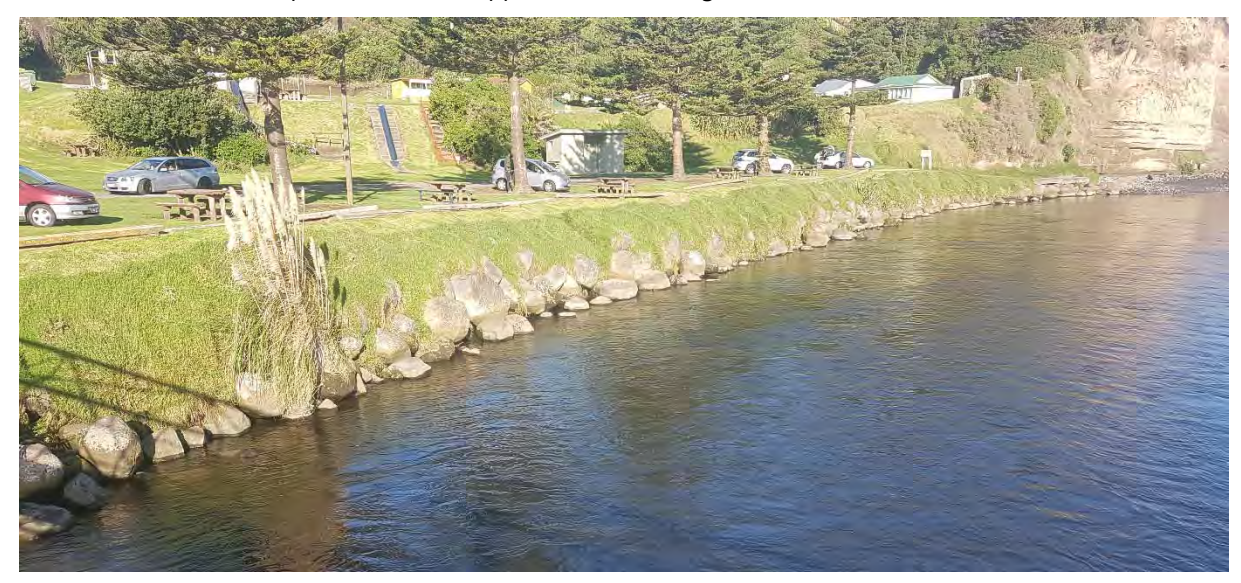
Photo 11 Kaupokonui Stream boulder rip rap protection works (6 May 2020)

Based on what was visible during the inspection on 6 May 2020, the boulder rip rap protection works on the true left bank of the Kaupokonui Stream appeared to be in a good condition.