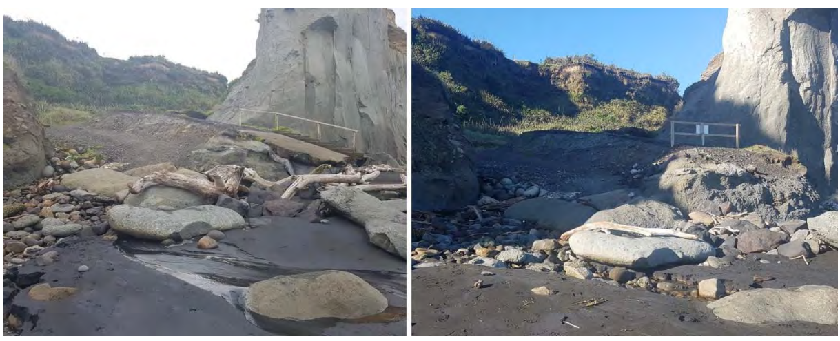
Photo 12 Denby Road access to Waihi beach (left, 2019; right, 2020)