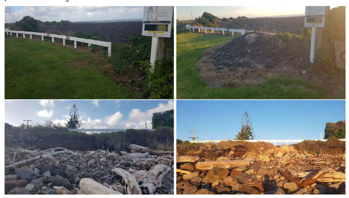
Photo 8 Bayly Road seawall before and after unauthorized works, 12 April 2019 (left), 6 May 2020 (right)

An inspection of the Bayly Road seawall was undertaken on 6 May 2020. Since the previous inspection, a sand/gravel mix had been backfilled into a number of the eroded sections along the scarp (Photo 8). A number of boulders also appeared to have been placed in front of the Bayly/Coast Road intersection. Given the ad-hoc and inadequate nature of these repair works, and that Council had not been notified of this work, it was suspected that the works had been carried out by an unauthorised third party. This was later confirmed after contacting STDC. The works did not appear to have caused any adverse environmental effects (i.e. the backfill material was of similar composition to the surrounding environment), and no further erosion issues were identified. However, the works were unauthorised and the degraded condition of the structure remained non-compliant with 5512-2 at the time of the inspection, as assessed during the previous monitoring round.