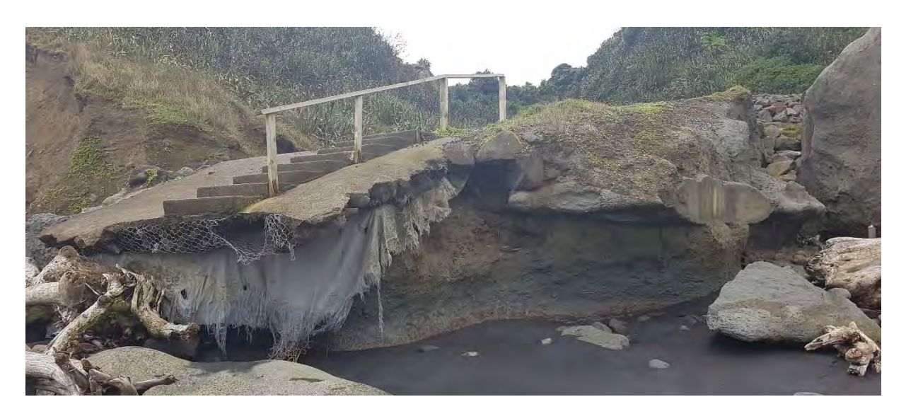
Photo 4 Remnants of Denby Road beach access structure consented under 6736 (April 2019)

STDC installed a gabion mattress at the bottom of the access track with the intention of improving access to the beach and helping control the erosion problems. The mattress measured 6 m x 2 m x 0.23 m in size and was placed on existing rocks. Surrounding the rocks a geo textile fabric was used to prevent the scouring of sand and to increase the longevity of the structure. Once completed, the structure was covered in concrete to further aid pedestrian access. The structure is authorised by coastal permit 6736 .