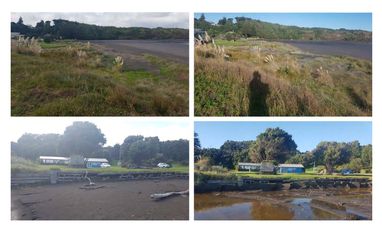
Photo 10 Opunake Beach, dunes (top left, 2019; top right, 2020), and pylon wall (bottom left, 2019; bottom right, 2020)