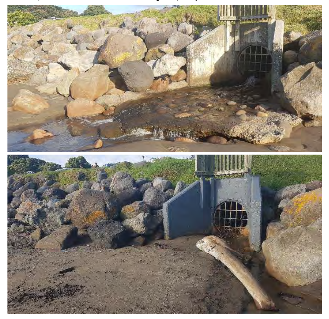
Photo 13 Ngamotu beach stormwater outlet (top: May 2019, bottom: April 2020)

Ngamotu Beach central stormwater outlet and Hongihongi Stream outlet (permits 5182 and 4592). No issues were identified with either structure. Evidence of sand build up was apparent at both outlets, with the concrete pad beneath the central outlet being completely buried (Photo 13).