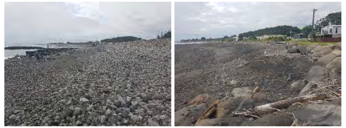
Photo 6 Waitara West (left) and East (right) beaches (both photos facing east), May 2020

River mouth groyne structures (permits 4600 and 9328). The condition of the structures themselves did not appear to have changed markedly from the previous inspection. As per the previous inspection, the beach on the western side of the river mouth retained a high volume of mixed cobbles and sand. In comparison, the shoreline of the eastern beach was further landward, and there were less cobbles present (Photo 6). During recreational water quality monitoring undertaken earlier in the year, Council Officers observed the eastern beach shoreline eroding into the sea due to wave action at high tide. Following these observations, aerial imagery was examined with regard to this changing shoreline. The analysis is presented and discussed in Section 3.2.