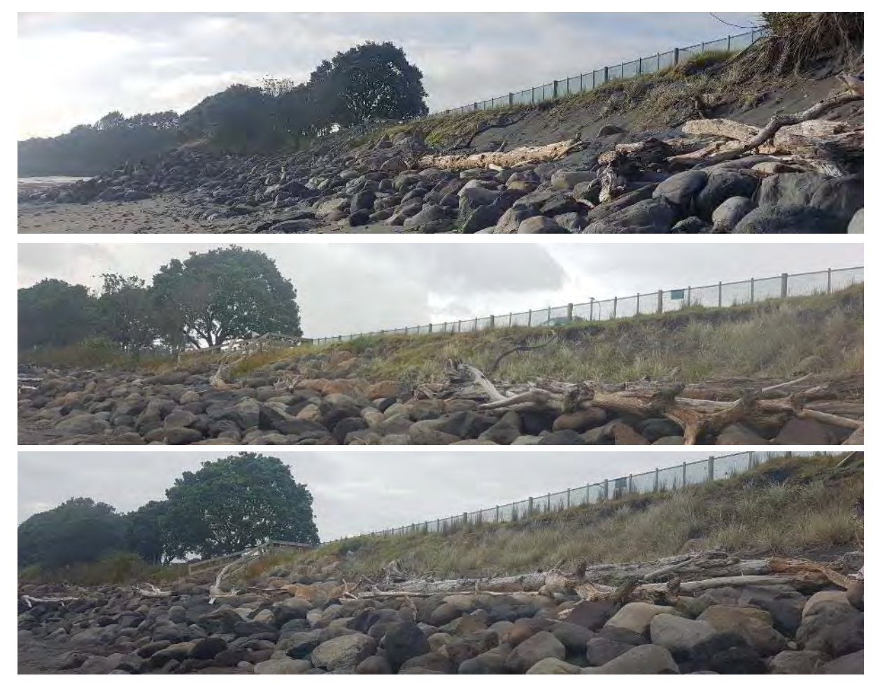
Photo 2 Urenui Beach half-wall and dunes (top: May 2018, middle: May 2019, bottom: May 2020)

Urenui Beach rock rip rap seawall and half wall extension (permits 5761 and 7007). Aside from some minor scour at the top of the structure, the rock rip rap seawall had remained in good condition since the last inspection. No issues were noted with the half wall, either. Some sections along the foot of this structure were partially buried by sand. Behind the structure, the sand binding grasses now appeared to be fairly well established (Photo 2). Neither rip rap structure appeared to be causing end effects, based on these observations and photo comparisons. Numerous sets of penguin footprints were observed at this end of the beach, which is not unusual for this location.