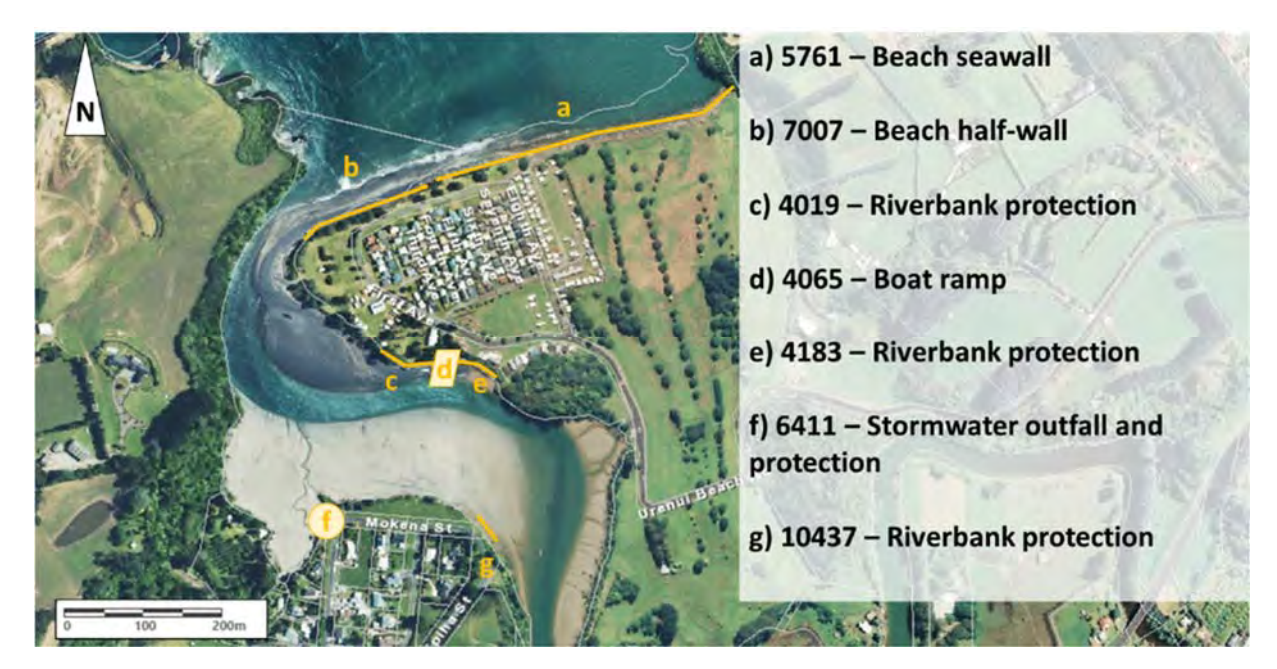
Figure 1 Indicative location of monitored coastal structures in Urenui