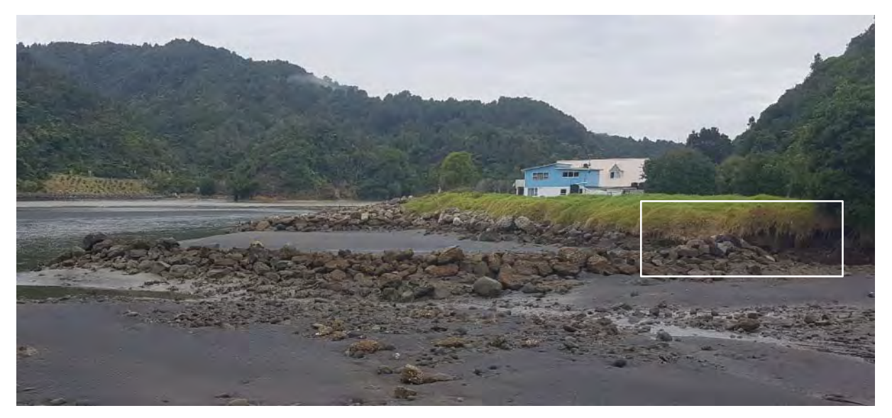
Photo 1 Tongaporutu rock groynes with section of scoured bank in white box, 1 May 2020

Rock groynes (permit 4818). The majority of this structure was found to be in good condition, however, a section of scoured bank had worsened since the previous inspection (Photo 1). Later in May, NPDC undertook maintenance works to resolve this issue. The groyne structure adjacent to the bank was built up in order to reduce the tidal currents that had been passing through and causing the erosion. During the inspection on 1 May, evidence was discovered of at least three penguin burrows in the land behind the rock work. As such, an additional inspection was carried out prior to the maintenance work in order to check for penguin burrows in close proximity to the work site. None were discovered.