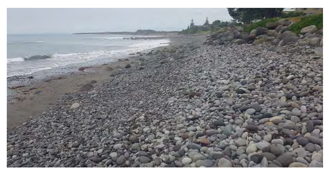
Photo 8 Bell Block seawall with some boulders further down the shore, May 2020