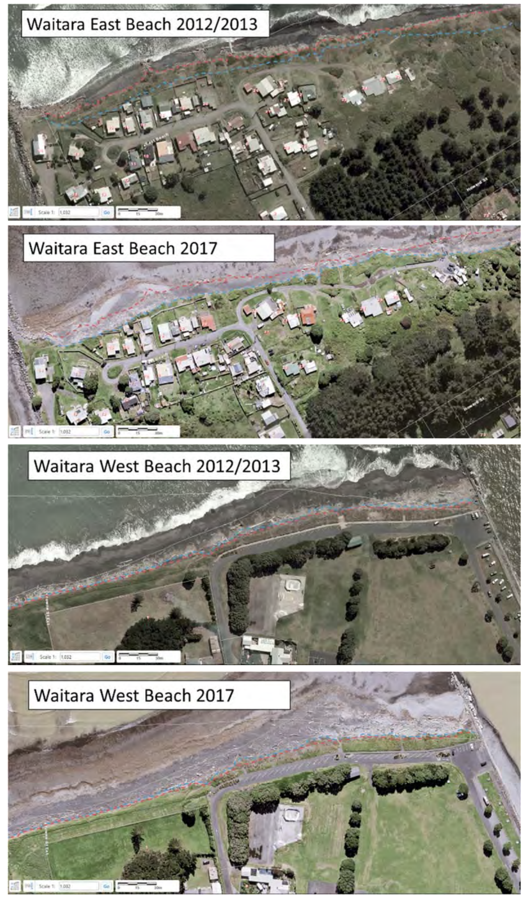
Figure 4 Waitara Beach shoreline change (red line: 2012/13 shoreline, blue line: 2017 shoreline)