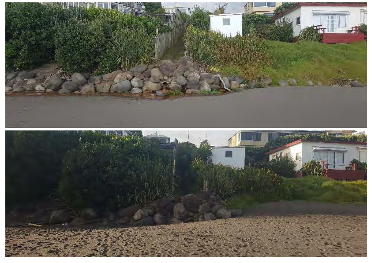
Photo 14 Messenger Terrace stormwater outlet at beach access (top: May 2019, bottom: April 2020)

Messenger Terrace stormwater outlets (permits 5412 and 5223). Both structures appeared to be in a satisfactory condition. The sand volume on this area of the beach had increased considerably from the previous year (Photo 14). As a consequence, stormwater drainage at these outlets appeared to have worsened; causing pooling at the base of the outlets and subsequent tracking along the top of the beach.