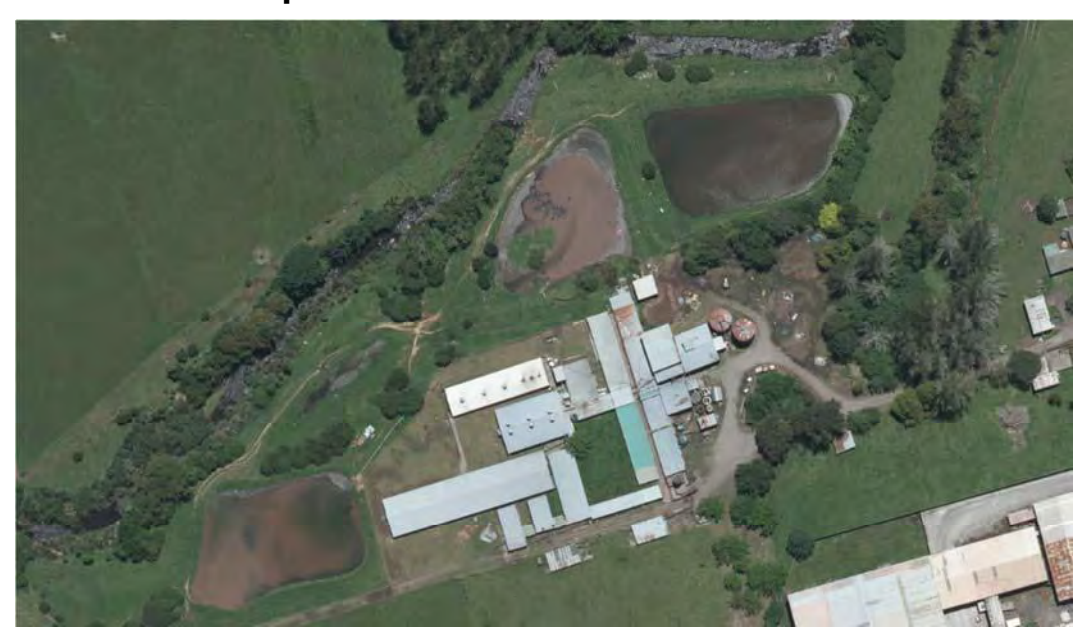
Figure 1 Aerial photograph of the piggery and waste water treatment ponds

The Company currently have the largest registered purebred herd in New Zealand with the NZ Pig Breeders Association of Berkshire, Duroc, Hampshire, Large White and Landrace breeds. Current stock numbers include up to 180 sows, gilts, weaners, boars and up to 150 piglets and any one time (Table 1).