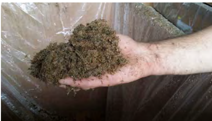
Photo 2 Solid piggery waste

The oxidation pond system consists of three ponds as shown in Figure 1. These ponds were designed to operate as an initial anaerobic pond, followed by two aerobic ponds. However, in practice the second pond operates as an anaerobic pond. Therefore there are two anaerobic ponds and one aerobic pond.