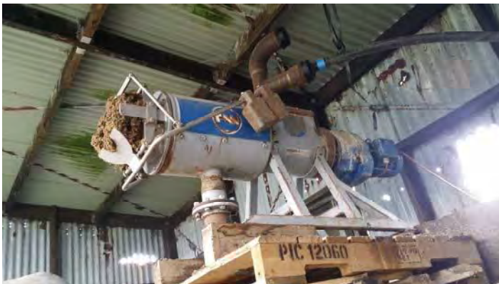
Photo 1 Cyclone effluent separator

Piggery wastewater is collected from various collection sumps situated around the piggery. Raw piggery effluent passes through a cyclone separator (Photo 1) which separates out the solid component (Photo 2) from the wastewater. Removal of solids from the wastewater stream significantly reduces the biochemical oxygen demand (BOD). Wastewater from the separation process is pumped back to the initial anaerobic pond. The solid waste is binned and sold as a soil conditioner (Photo 3).