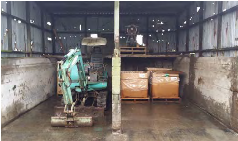
Photo 3 Solids separation area where solid waste is stored in bins

These ponds are adequately sized for the treatment of the piggery wastes provided the system is regularly maintained.