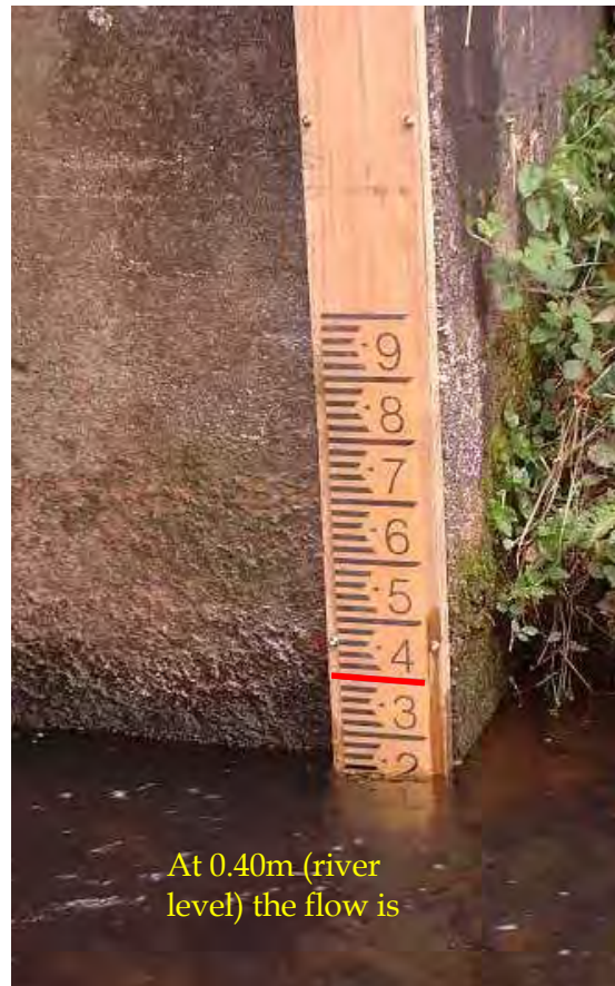
At 0.40m (river level) the flow is