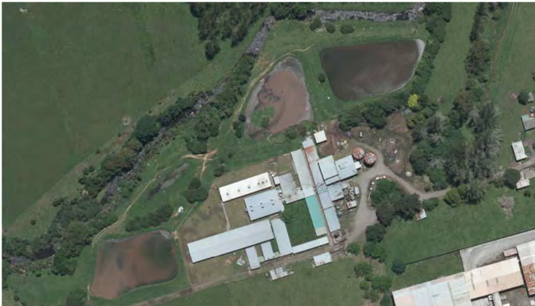
Figure 1 Aerial photograph of the piggyery and waste water treatment ponds

The Company currently have the largest registered purebred herd in New Zealand with the NZ Pig Breeders Association of Berkshire, Duroc, Hampshire, Large White and Landrace breeds. Current stock numbers include up to 155 sows, gilts, weaners, boars and up to 100 piglets and any one time (Table 1). Future plans are to increase stock numbers up to 180 breeding sows.