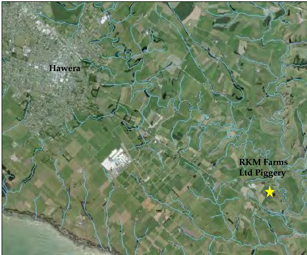
Figure 1 Approximate location of RKM Farms Limited Piggery