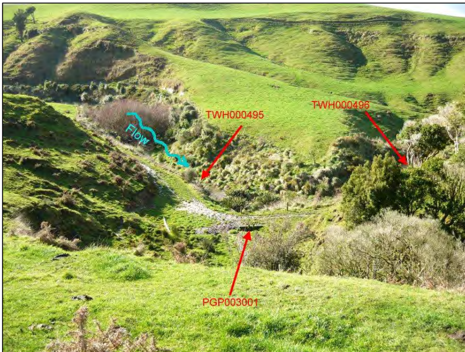
Figure 2 Location of sampling sites