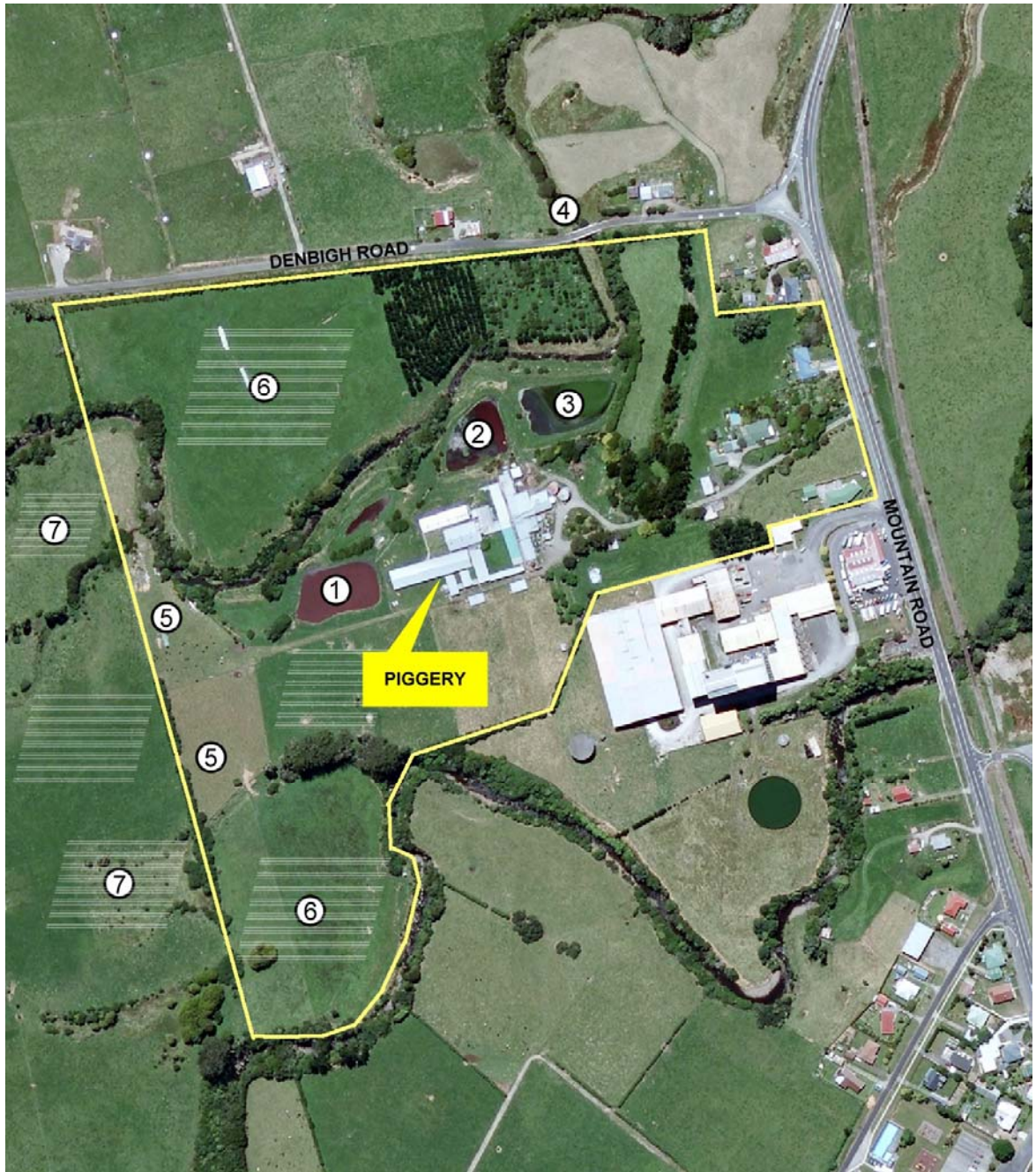
Figure 1 Piggery and disposal system of the NZ Pure Bred Genetics Limited site

1 Initial anaerobic pond; 2 Anaerobic pond; 3 Final aerobic pond; 4 Staff gauge at Denbigh Rd Bridge; 5 Offal disposal; 6 & 7 Showing spray irrigated areas