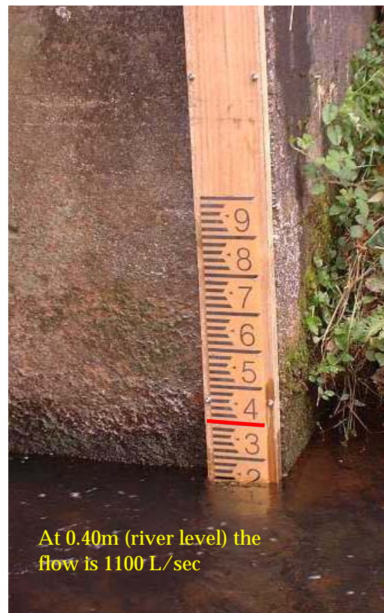
At 0.40m (river level) the flow is 1100 L/sec