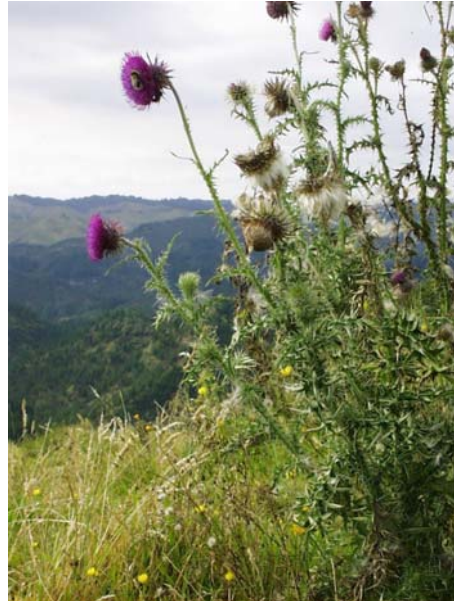
Photo: Nodding and Plumeless thistle are virtually indistinguishable from one another.

Cabbage thistle, holy thistle, lady's thistle, milk thistle, spotted thistle.