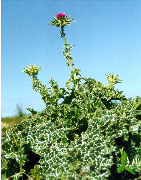
Photo: Variegated thistle