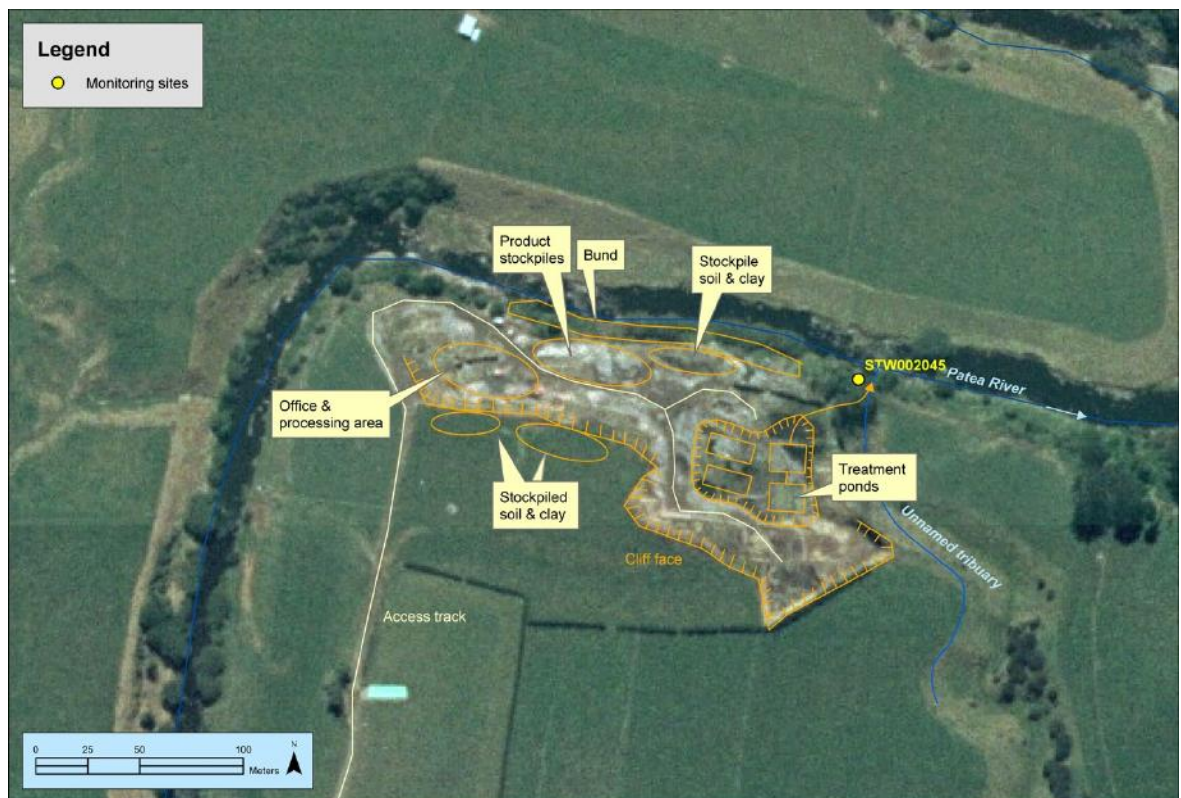
Figure 1 Taunt Contracting Limited Bird Road quarry - site layout and discharge sampling site

Site reinstatement is carried out with hard fill materials sourced from the quarry.