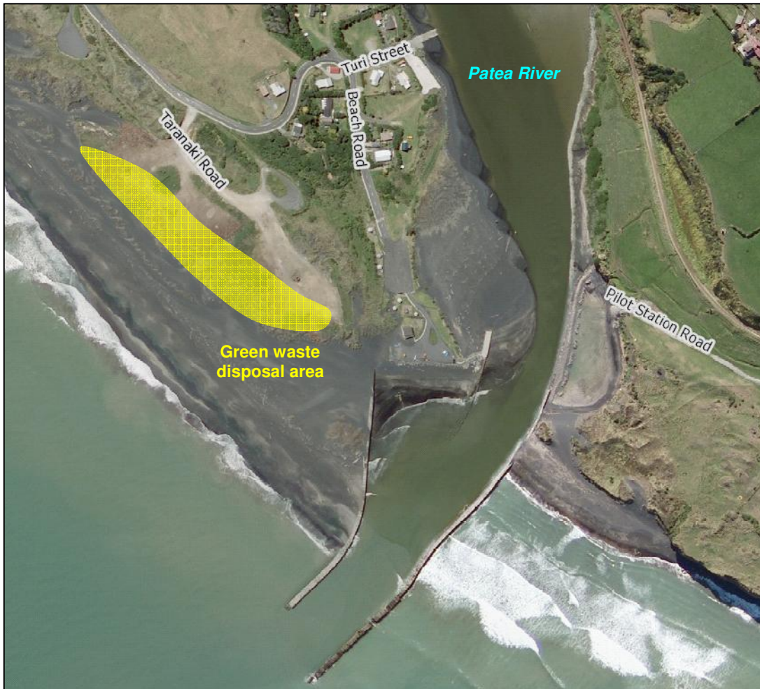
Figure 2 Aerial view of the Patea Beach green waste disposal area