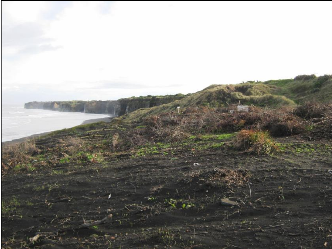
Photograph 1 Patea Beach greenwaste disposal site 24 June 2011

A site visit was made to conduct a compliance monitoring inspection . The weather was fine with 15 mm rain falling over the previous 72 hours. The site was tidy and organised and no unacceptable wastes were found. There were no issues in regards to ponding, odour or leachate.