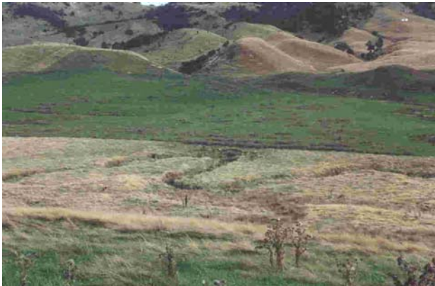
Fig 2. A poorly thought out bull finishing 'techno-system'

The simplest approach for any intensification programme whilst managing your natural resources is to split your farm into different land management units. The chart below shows how to do this.