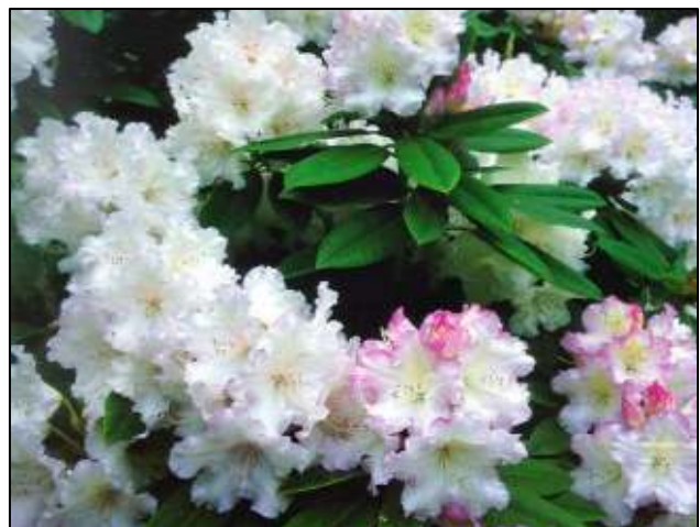
Pukeiti has the most comprehensive rhododendron collection in the southern hemisphere.

Established in 1951, the Pukeiti Rhododendron Trust owns and manages the Gardens. The Gardens attract between 8,000 and 10,000 visitors annually. Over the past few years, visitor numbers have remained relatively constant with peak visitor numbers occurring in October and November in association with the annual Taranaki Rhododendron Festival.