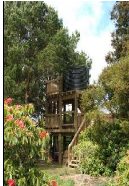
Lookout in the children's playground