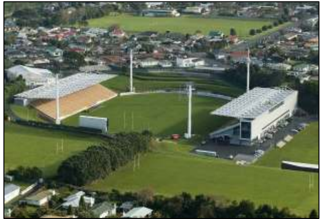
Yarrow Stadium, New Plymouth

In 2002, after an extensive consultation process and following the promulgation of the Taranaki Regional Council Empowering Act 2001, the Council provided a one-off grant of $9.6 million to the Taranaki Events Centre Trust for the purposes of developing Yarrow Stadium. Of this, $6.4 million is planned to be repaid by way of regional targeted rates over a period of 10 years. In terms of Council activities, no further funding is provided for Yarrow Stadium. The only activity undertaken in this area is the repayment of the Council's grant from the regional targeted rates ($876,000 per annum over 10 years). 2008/2009 was the seventh year of the 10-year life of the targeted rate