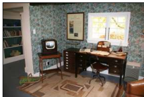
Interior of Cottage