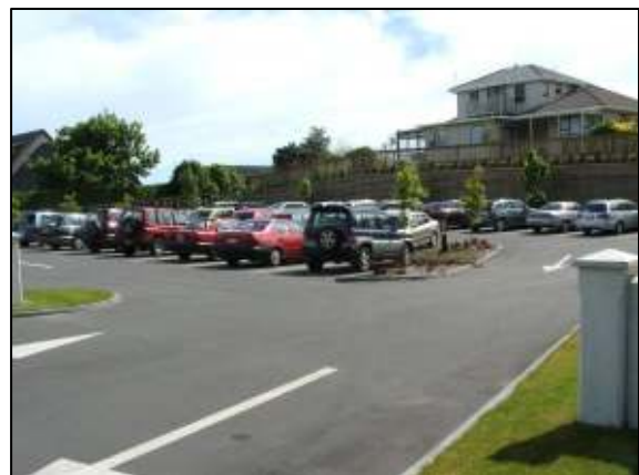
Carpark at Tupare