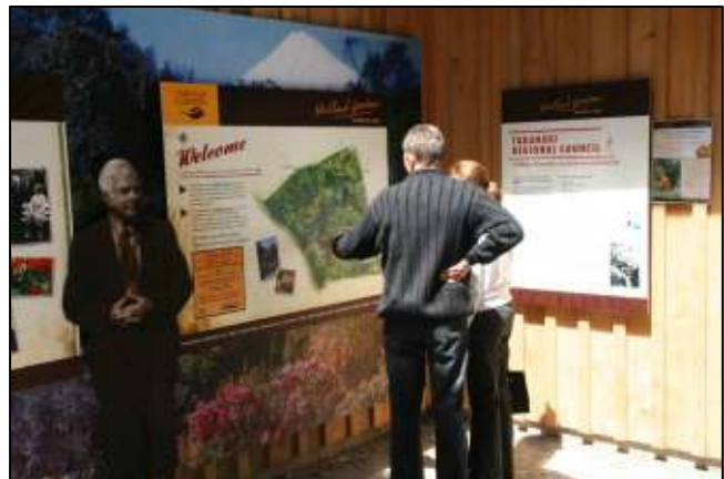
Visitor information at the Gatehouse