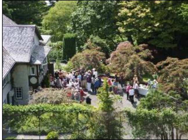
Floral Art Workshop

This is the first stage, the next stage will see the design and installation of a toilet/shelter building.