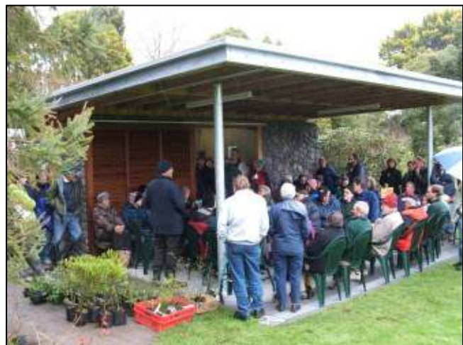
Saving seed workshop in the new pavilion