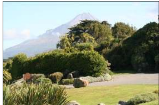
Carpark at Hollard Gardens