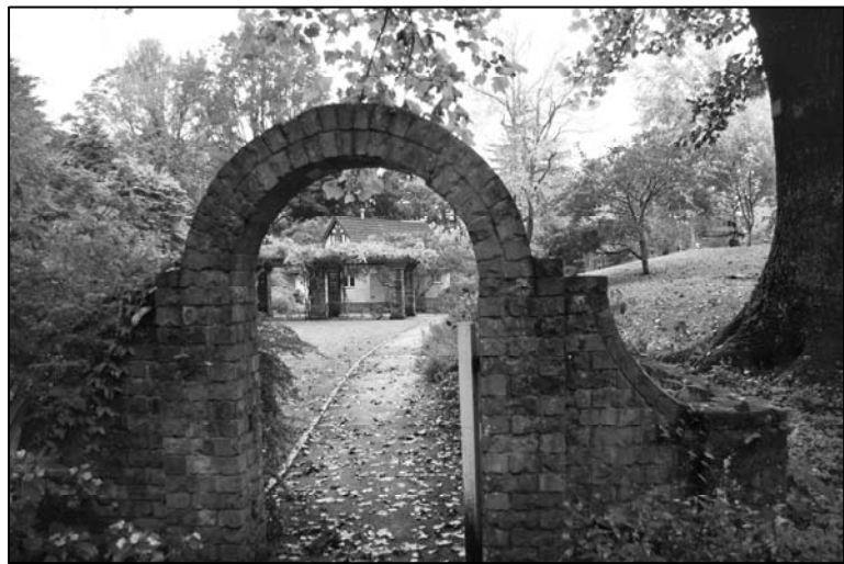
Tupare in Autumn

In 1985, the Queen Elizabeth II National Trust purchased Tupare. As from 1 July 2002, ownership and responsibility for the day-to-day management of the Gardens was transferred to the Council. The Gardens are estimated to attract around 2,000 to 3,000 visitors annually. The main visitor season is between September to March and peaking over the annual Taranaki Rhododendron Festival in October/November.