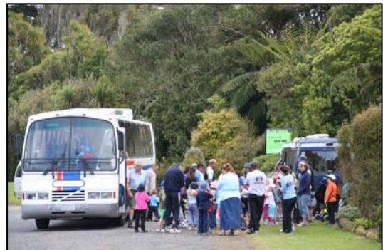
Visitors arriving at Hollard Gardens

BG Base, a plant database system, has been installed in the Council computer system and data entry has commenced for Hollard Gardens. This