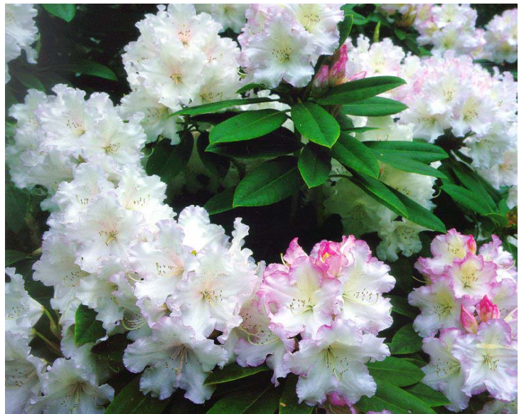
Pukeiti has the most comprehensive rhododendron collection in the southern hemisphere.

Established in 1951, the Pukeiti Rhododendron Trust owns and manages the Gardens. The Gardens attract between 8,000 and 10,000 visitors annually. Over the past few years, visitor numbers have remained relatively constant with peak visitor numbers occurring in October and November in association with the annual Taranaki Rhododendron Festival.