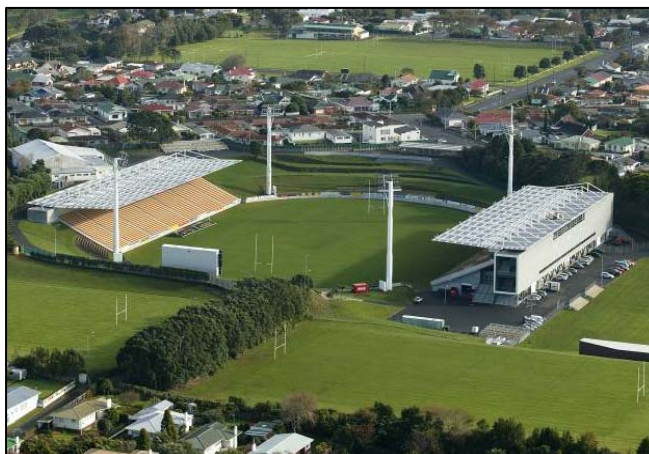
Yarrow Stadium, New Plymouth

In 2002, after an extensive consultation process and following the promulgation of the Taranaki Regional Council Empowering Act 2001, the Council provided a one-off grant of $9.6 million to the Taranaki Events Centre Trust for the purposes of developing Yarrow Stadium. Of this, $6.4 million is planned to be repaid by way of regional targeted rates over a period of 10 years. In terms of Council activities, no further funding is provided for Yarrow Stadium. The only activity undertaken in this area is the repayment of the Council's grant from the regional targeted rates ($876,000 per annum over 10 years). 2006/2007 was the fifth year of the 10-year life of the targeted rate