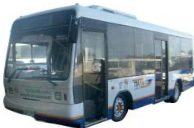
The City Link brand was developed for the launch of the new bus service in July 2008.

The completion of the two-year trial of bus services and the changeover to a new operator at the end of the 2007/2008 year involved the Public Information section in a range of communications activities including media management, online surveys, brand design, vehicle signage, production of tickets and timetables, website development and radio and print advertising.