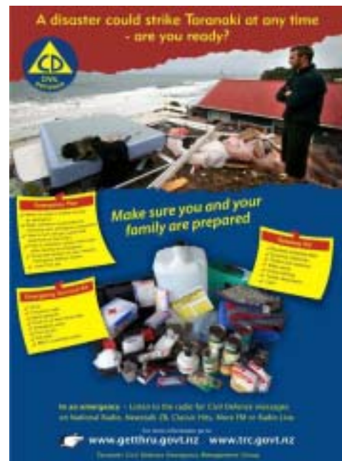
Posters were displayed around the region during Disaster Awareness Week.

The main Council website, www.trc.govt.nz , experienced considerable growth in traffic during 2007/2008. The monthly average of 29,963 (26,645) unique visits was up around 12% on the previous year.