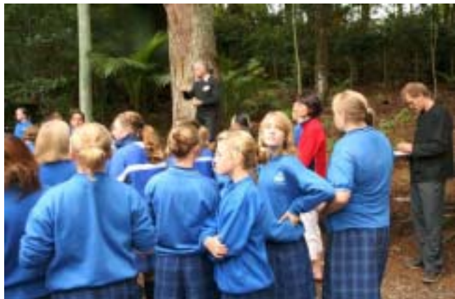
Devon Intermediate students at the launch of the Puke Ariki 60 Springs environmental education programme.

The 2007/2008 Annual Project is the 60 Springs environmental education programme which targets intermediate and secondary students in the region. A pilot programme with Devon Intermediate was launched in May 2008.