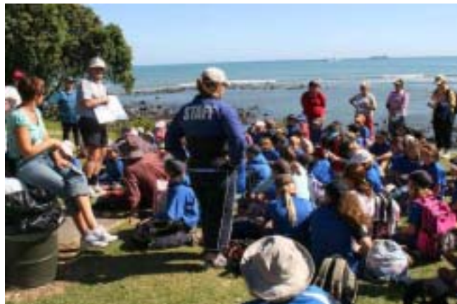
A school visit is often followed up by a field trip.

The Education Officer also offers classroom visits on environmental topics that relate specifically to Council activities. These visits are provided on request and must be part of a broader study. The Education Officer provides technical knowledge, presentations, activities or experiments, with the emphasis on providing support for the teacher.