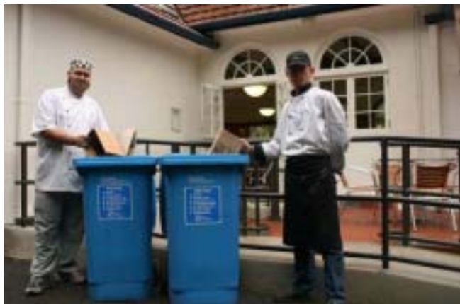
The Pukekura Park kiosk received an environmental award for energy efficiency and waste minimisation.

In May 2008, seventeen environmental awards were presented. The award winners are listed in Appendix I.