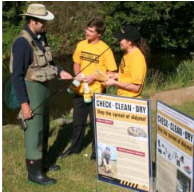
The didymo campaign took the "Check, Clean, Dry" message to the main freshwater users such as anglers.

The Public Information section provides communications advice, graphics and design support for a wide range of communications and education activities that are delivered by staff in other sections, across all Council activities.