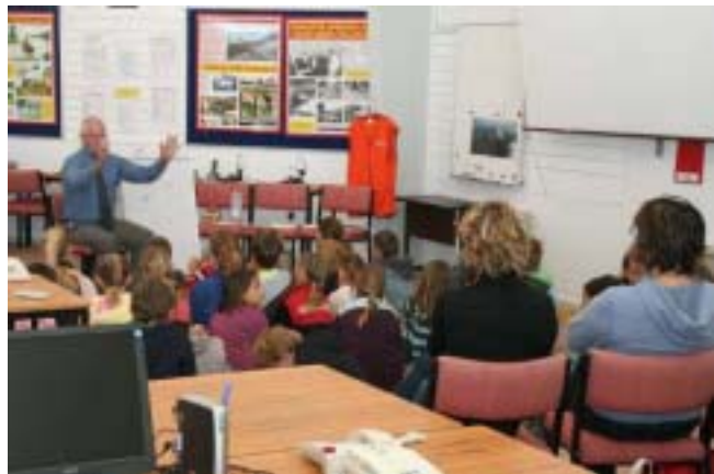
The Council Education officer hosting a class at the Taranaki Emergency Management office.

The 2007/2008 year saw an increasing number of schools become actively involved in the