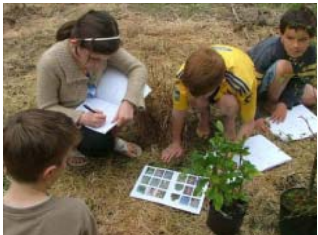
Students from Frankley Primary School identifying trees as part of a riparian study