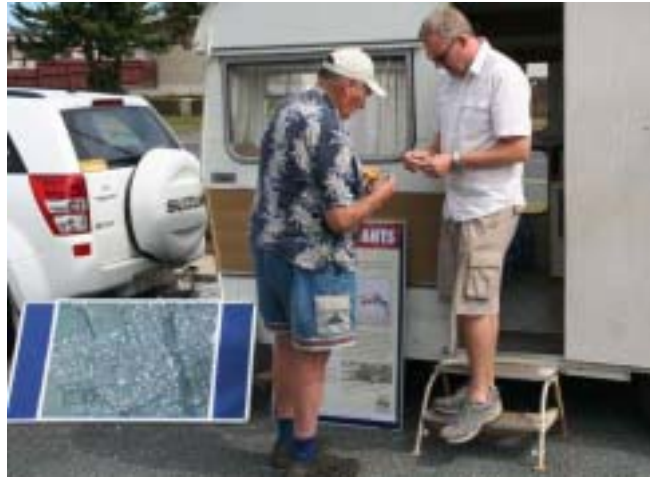
Pest Management staff helped the public identify Argentine ants.

Sponsorship was also provided for a small number of community, educational or agricultural events that promoted actions that benefit the Taranaki environment. These included Seaweek 2008, the Science and Technology Fair for schools, the Youth Environment Forum and the Young Enterprise Scheme.