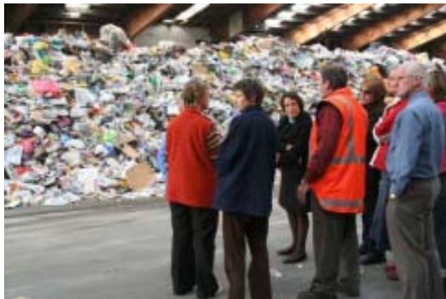
Teachers visited the New Plymouth Recycling Centre during a professional development session.

Six schools were represented at this workshop which outlined how the Education Officer can assist teachers and schools to develop a waste minimisation and recycling programme. Feedback from the teachers indicated that highlights were guided tours of the Colson Rd Landfill, the Transfer Station and the Recycling Centre.