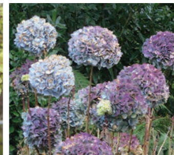
The last of the Hydrangea before pruning