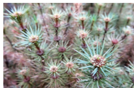
Dawsonia superba - A male colony of the moss.