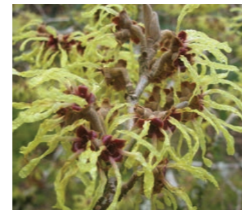
Hamamelis mollis 'Pallida'