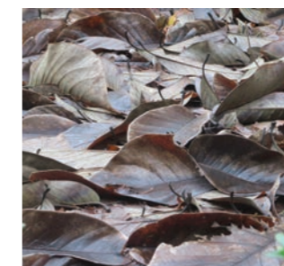
Fallen Magnolia leaves