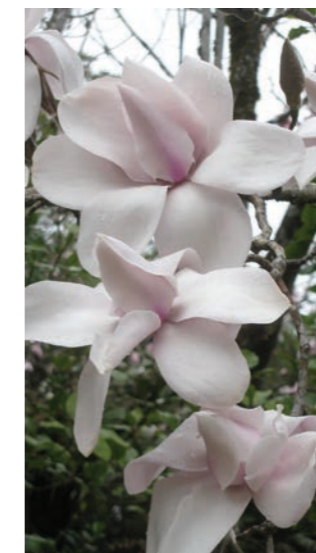
Magnolia "Cook's Supreme"

The Trust will have a role to play in assisting in the collection and on-going conservation of these rhododendrons.