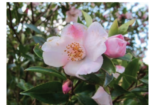
Camellia 'Snow Drop'