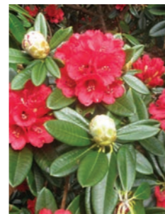
R. arboreum ssp. albotomentosum