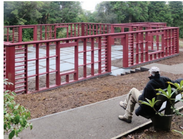
The Keiller Garden takes shape.

The wet cold dreary winter which seemed to linger forever has made the promise of spring even better.