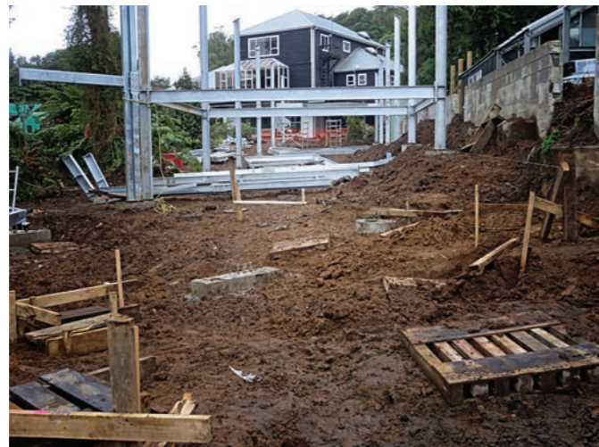
The Vireya House under construction, completion scheduled for the Autumn meeting in March.