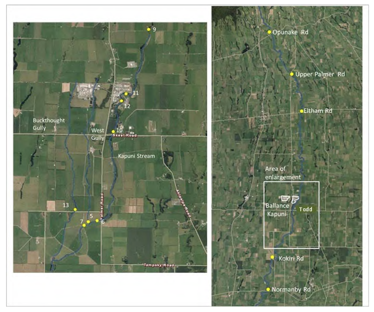
Figure 2 Biomonitoring sites in the Kapuni catchment