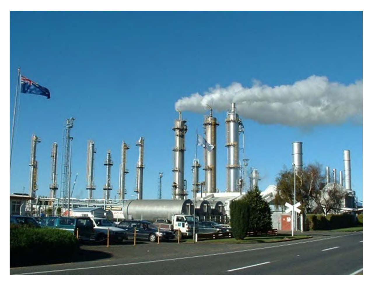
Photo 1 Kapuni Gas Treatment Plant (KGTP) during three train operation

In 1985, KGTP was expanded with the installation of the low temperature separation (LTS) gas conditioning plant which processed the high carbon dioxide content Kapuni gas for water and heavy hydrocarbon removal only. The conditioned gas was supplied to the region's methanol plants so that it could be blended with the much lower carbon dioxide content Maui gas for more efficient methanol production. Methanex reduced its production capacity and as a result the gas conditioning plant was mothballed in May 2005.