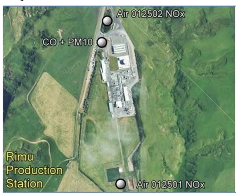
Figure 2 Air monitoring sites at Rimu Production Station

Passive sampling devices were deployed at both monitoring locations (Figure 2) from 12 January to 2 February 2023 to measure ambient NO_x . The samplers absorb NO_x over the duration of the deployment and are sent for laboratory analysis. The laboratory results are used to calculate 1- and 24-hr time weighted averages (TWA).