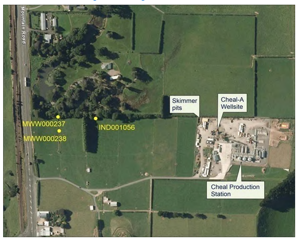
Figure 1 Location of the Cheal Production Station and associated sampling sites

Chemical water quality sampling of the combined discharge from the Cheal Production Station and Cheal-A wellsite was undertaken twice during the 2022-2023 year. Table 3 presents the results. The location of the sampling site (IND001056) is shown in Figure 1.