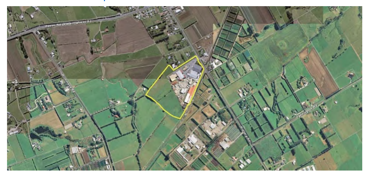
Figure 1 Aerial location map of Hickman JD 1997 Family Trust

This site was originally the Brixton Dairy Factory until it shut down and the discharge resource consent was transferred into Hickman JD 1997 Family Trust.